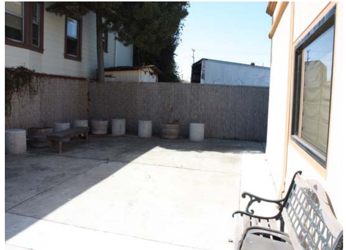
Back Courtyard or Parking